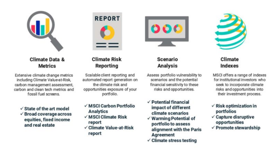
Figure 1: Climate Change Solutions

An increasing portion of our revenues comes from products that relate to certain trends, such as ESG investing, including climate change. We see significant opportunities for climate-related products and services among financial institutions and pension plans: